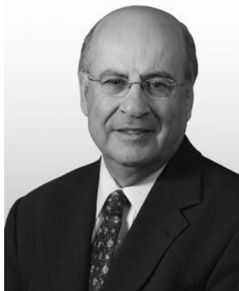
Age 69 Toronto, Ontario, Canada New Nominee Independent